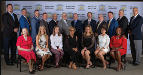
2019-2020 Board Members