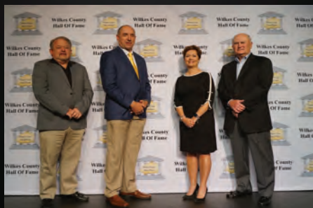
2020-2021 New Board & Advisory Members