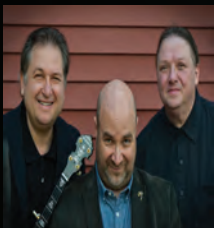
THE KRUGER BROTHERS